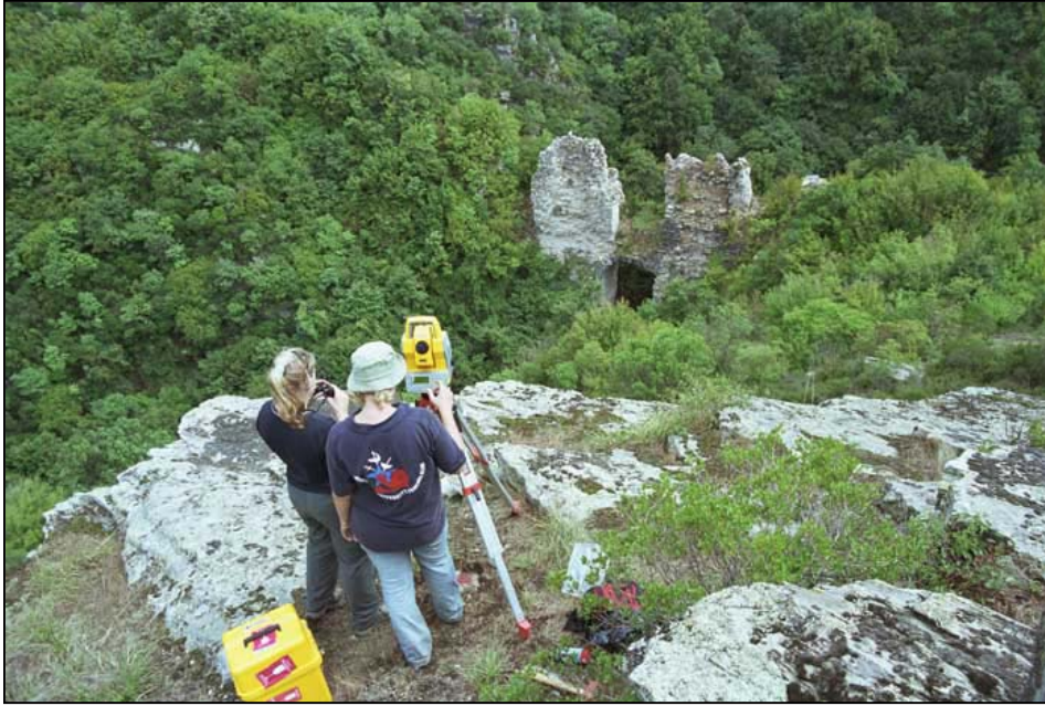
Fig. 4. Reflectorless Total Station survey at Balligerme.