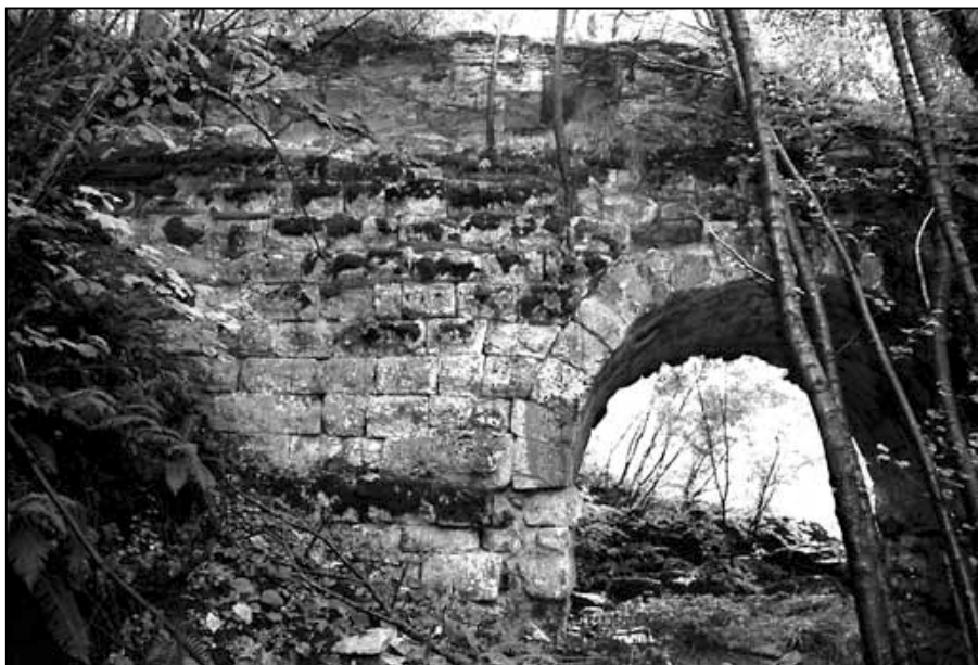
Fig. 2. Aqueduct bridge spanning the Elmali Dere near Aydınlar.

Between Binkılıç and the Karamanoğlu Dere the channel was seen on several occasions in tributaries of the İstranca Dere (Manganez Dere, Cineviz Dere, Babadar Dere and Elmali Dere) and was found to be uniformly 1.5-1.6m wide (Fig. 2). Only in the Karamanoğlu Dere can two different gauges of channel be identified: the first, a 1.5m wide channel which passed through the ridge on the east flank of the valley by means of tunnel and the second, a 1m wide channel which was carried on a longer route around the same ridge. It was in no place possible to establish the physical relationship between the two channels.