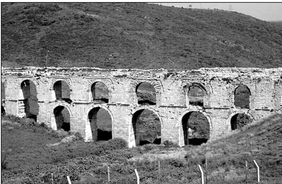
Fig. 5. The Maz'ulkemer aqueduct bridge.

Finally a further investigation was made of the Ottoman supply line which runs 15km to the west of the city to sources in the vicinity of Halkalı (Fig. 5). Here the Maz'ulkemer aqueduct bridge is of particular interest as the only apparent evidence of an earlier Byzantine or Roman system on this line (Mango, 1995). Considerable effort was made to gain access to this bridge, which is located within a military zone. With the support of Dr Alpay Pasinli and the assistance of the Topkule Kışlası personnel we were able to study the water bridge in great detail. We have concluded that this bridge, while showing several phases of modification, is entirely Ottoman in date. It therefore seems less likely now that the Halkalı springs provided the original sources for the Hadrianic water supply of the city, which instead probably originated north of the city in the Cebeciköy valley, on what was later the Ottoman Belgrade Forest line (see (Çeçen, 1996b)). A detailed article on the Maz'ulkemer bridge is currently under preparation to ensure the rapid publication of these results.