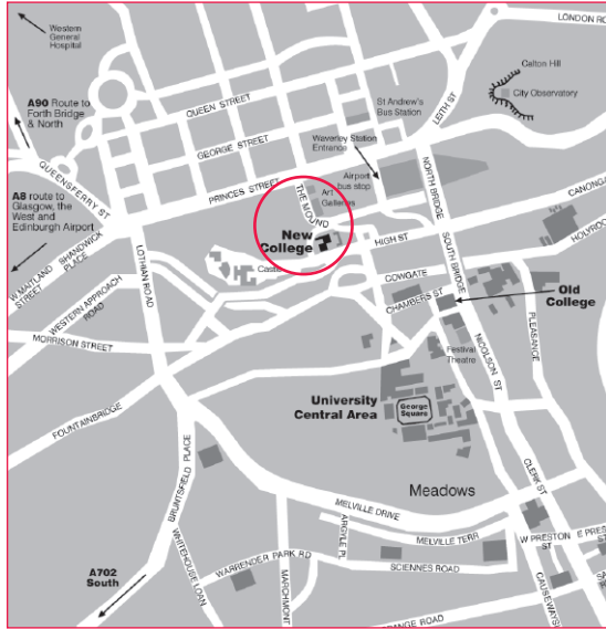
Edinburgh city centre